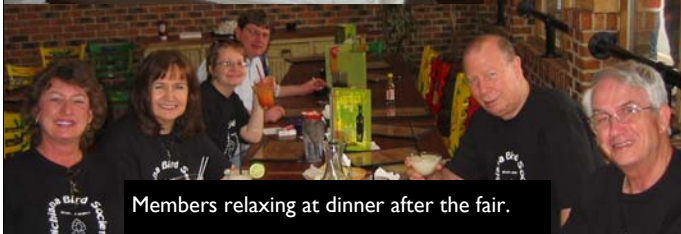
Members relaxing at dinner after the fair.